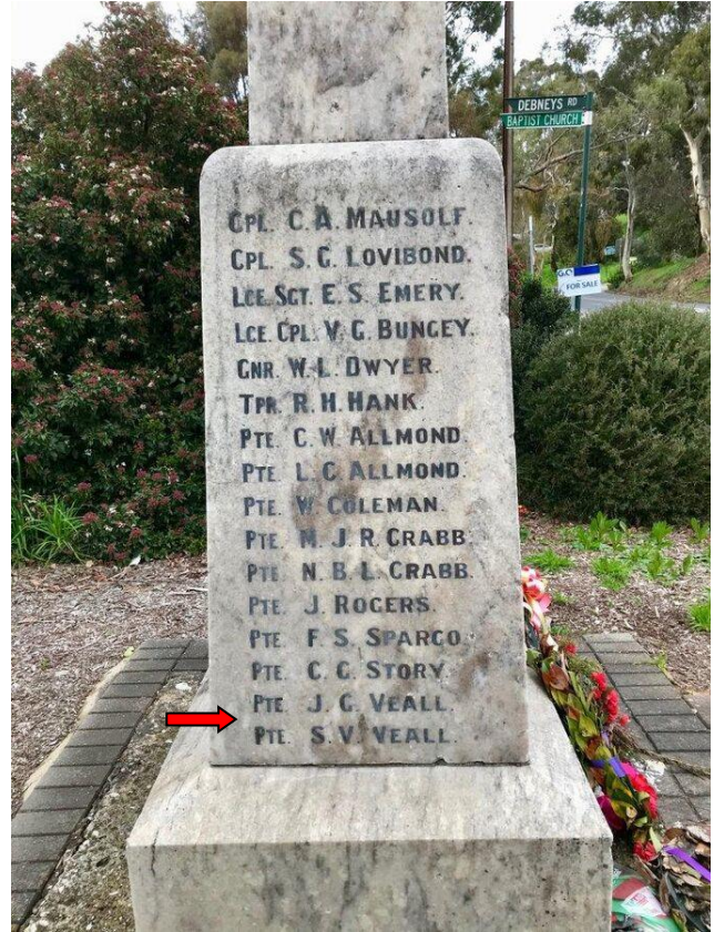
Norton Summit War Memorial