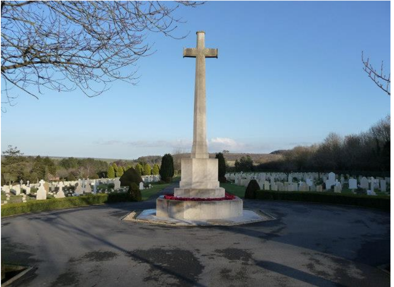
Tidworth Military Cemetery, Wiltshire