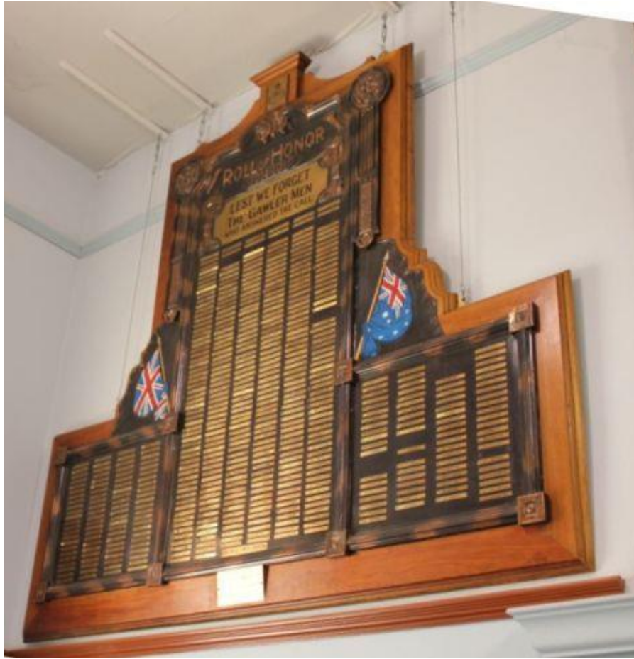
Gawler Soldiers Memorial Roll of Honour